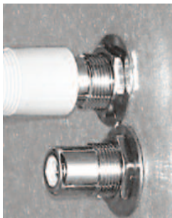
The RCA-type male plug on the power cable from the ZSA-I quickly connects to the plug on the back of the panel.